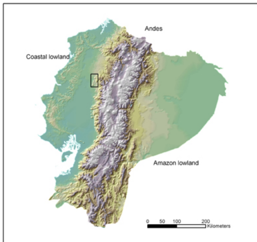
Figure 2. Contour map of Western Ecuador. Both the western Andean slopes and the much lower coastal Montañas de Mache appear. The isolated foothill range, including Centinela ridge, found in southern Pichincha and northern Los Ríos provinces, has been outlined with a box.

Figura 2. Mapa topográfico del Occidente del Ecuador. Se ve ambas las faldas Andinas occidentales y a largo de la costa el más bajo Montañas de Mache.