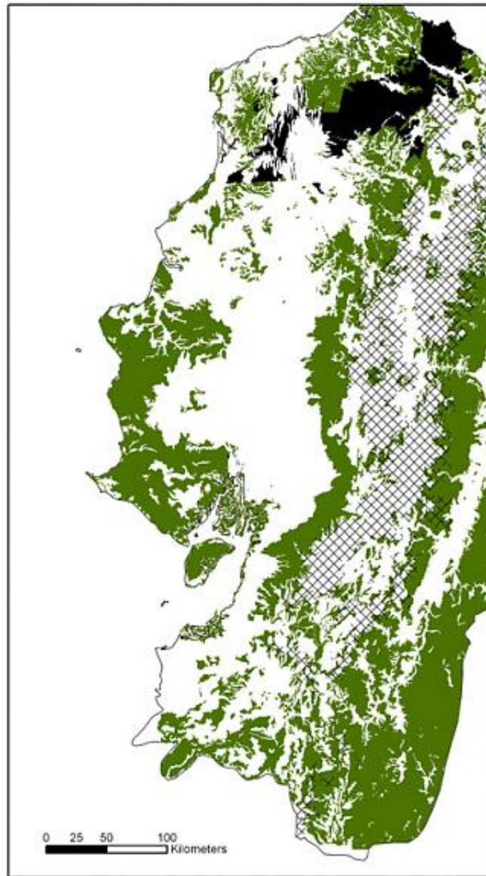
Figure 3. Extant forest vegetation in western lowland Ecuador according to satellite imaging. Gray areas are those regions still covered with forest, while white areas have been deforested (or never had forest). Due to the dense cloud-cover no satellite-images were available of the very humid northeastern areas shaded with a lighter gray, but these areas remain mostly forested. Note the 1000 m contour line on the western Andean slopes.

Figura 3. Vegetación de bosque existente en el occidente bajo del Ecuador de acuerdo a imagen satelital. Las áreas grises son regiones cubiertas aún con bosque, mientras las zonas blancas han sido deforestadas (o que nunca han tenido bosque). Debido a la presencia de muchas nubes no había imagen satélite de zonas muy húmedas en el norte (mostrado con un gris mas claro), pero esas áreas todavía son boscosas. Nota la línea de contorno de 1000 m en las faldas andinas.