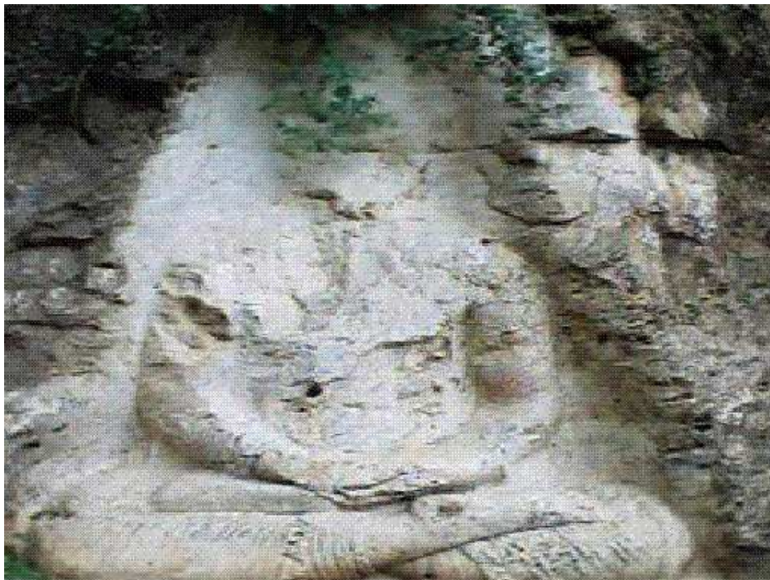
Figure 2: Buddha carved on a mountain rock near TindoDog, Swat

live. Some historians consider Swat as the center of Gandhara civilization.